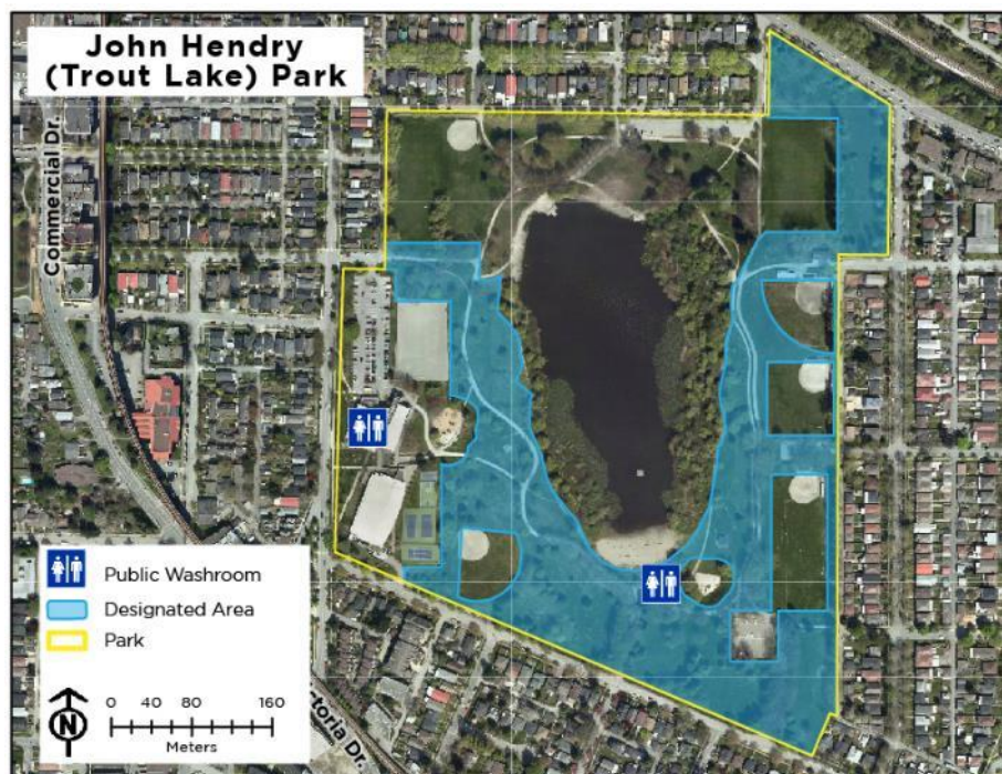
6. John Hendry (Trout Lake) Park – Designated Area