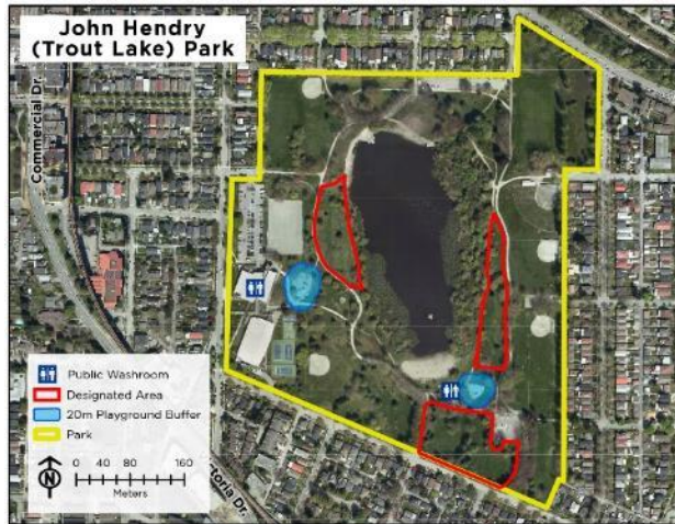
Figure 1: John Hendry Park – 2021 Pilot Sites

In some parks, these adjustments have resulted in an expansion of pilot site areas; for example, as shown in Figures 1 & 2 below, the pilot sites in John Hendry Park have been adjusted from the three separate areas in 2021, to one designated area falling within the overall park boundary, with playing fields, playgrounds, dog off-leash areas, facilities, natural areas, etc. omitted.