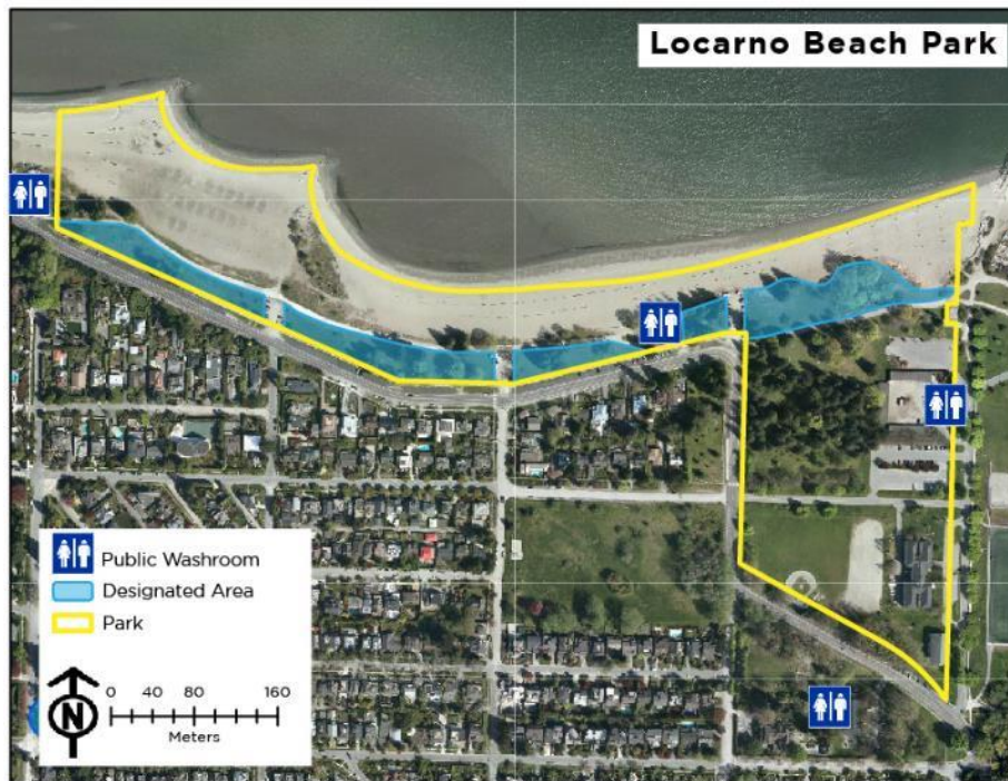
9. Locarno Beach Park – Designated Area