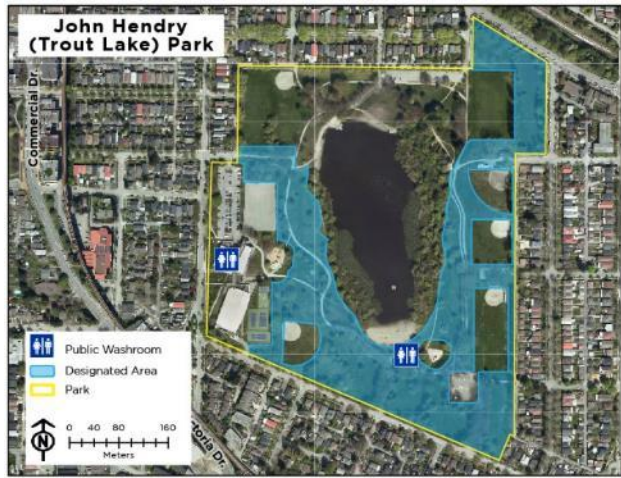
Figure 2: John Hendry Park – 2022 Pilot Site

Subject to Board approval of the draft by-law amendments, staff are recommending the by-law be presented for enactment at the Regular Board meeting immediately following Committee to provide staff time to coordinate the necessary signage and communications required to launch the pilot in early June as targeted.