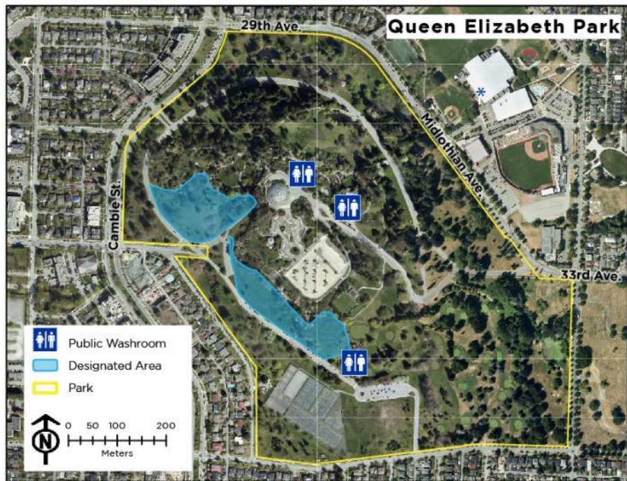
15. Queen Elizabeth Park – Designated Area