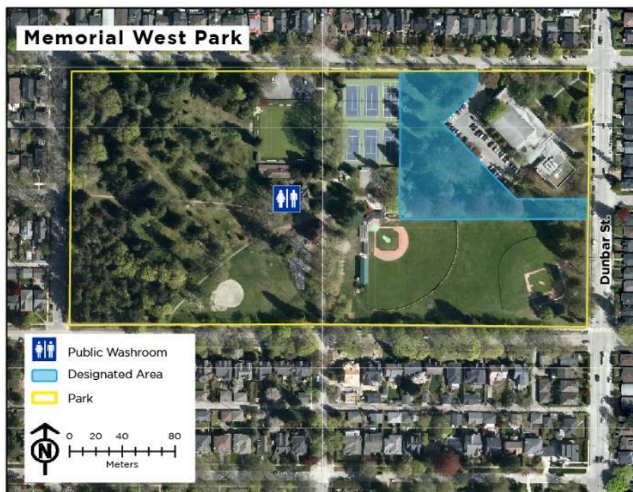
12. Memorial West Park – Designated Area