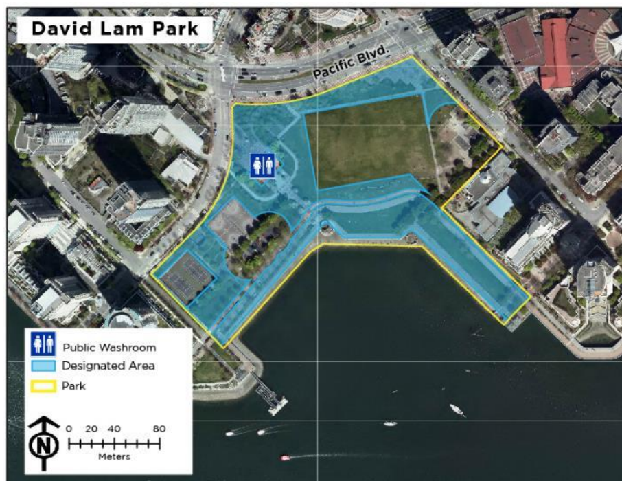
2. David Lam Park – Designated Area