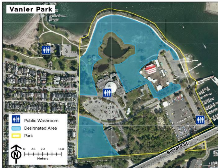
21. Vanier Park - Designated Area