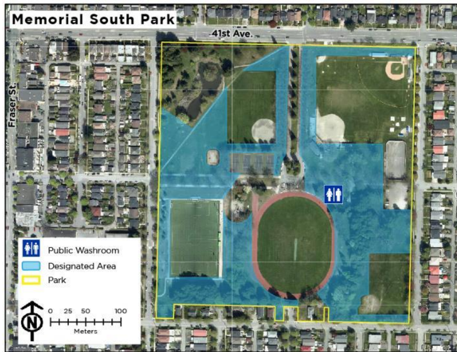
11. Memorial South Park – Designated Area