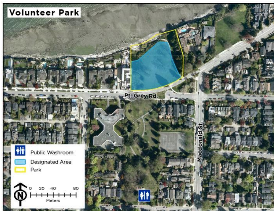
22. Volunteer Park - Designated Area