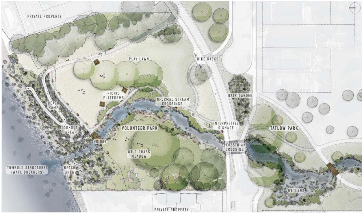
Figure 1 - Tatlow and Volunteer Parks Creek Daylighting approved concept plan

The major improvements to the parks include: