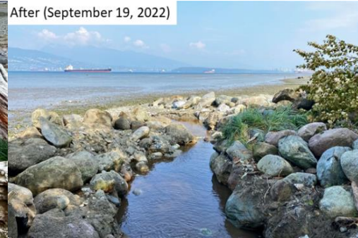
After (September 19, 2022)