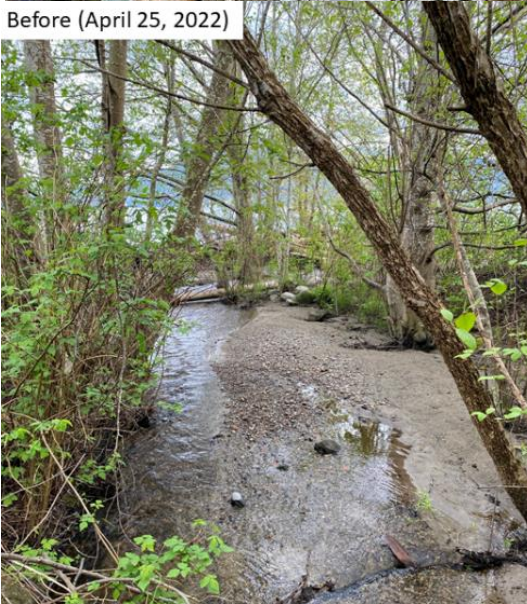
Before (April 25, 2022)