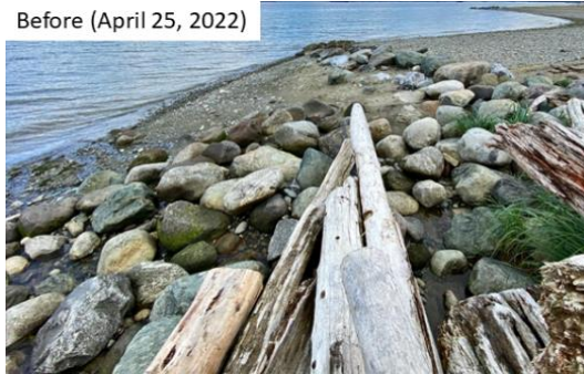
Before (April 25, 2022)