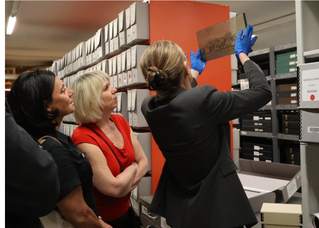
Commissioners and City Councillors attended the City of Vancouver Archives 90 th Anniversary tour.