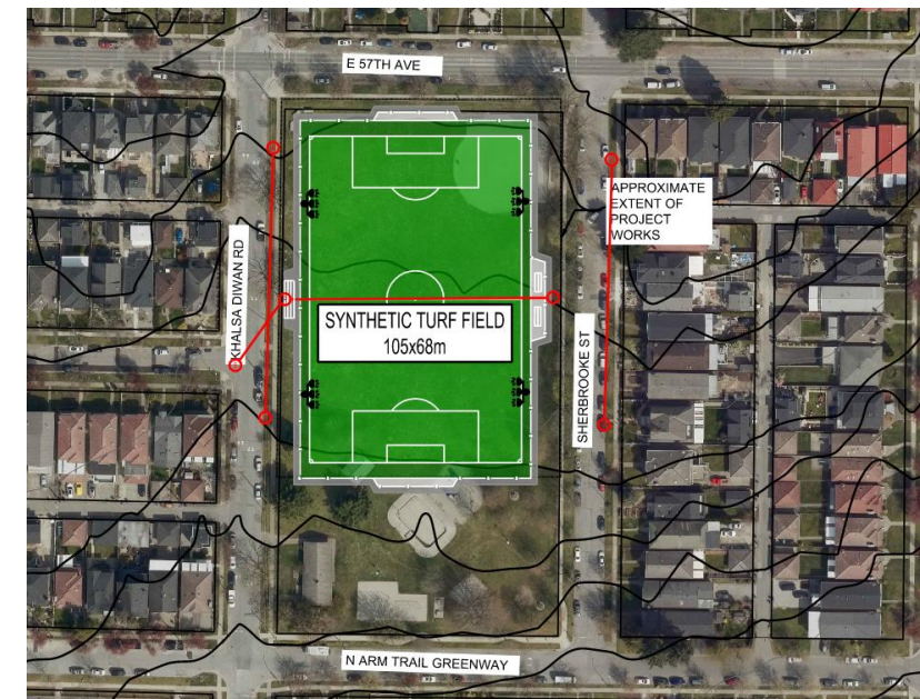
Ross Park (north field) preliminary concept only