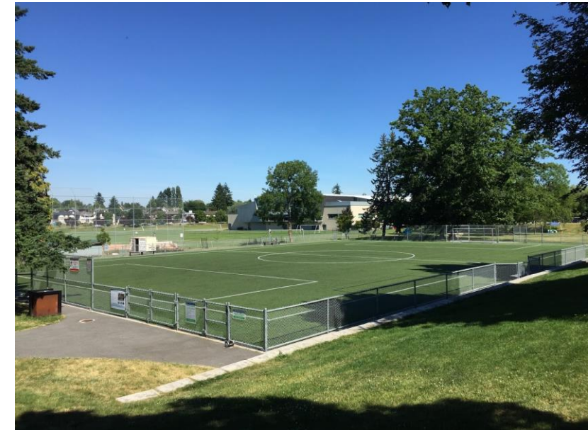
ROM – Rough order of magnitude costs based on similar projects – includes cost escalation