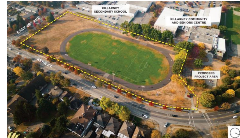
ROM – Rough order of magnitude costs based on similar projects – includes cost escalation