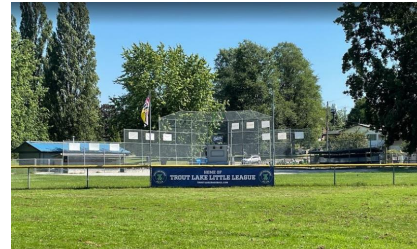
ROM – Rough order of magnitude costs based on similar projects – includes cost escalation for a like for like renovation in current location

*delivered as part of the Sports Field Enhancement Program