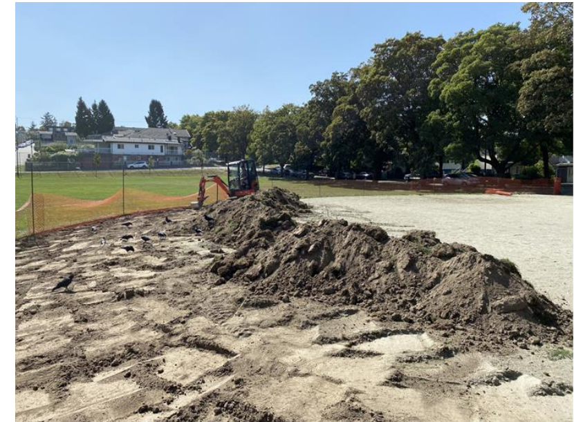
ROM – Rough order of magnitude costs based on similar projects – includes cost escalation