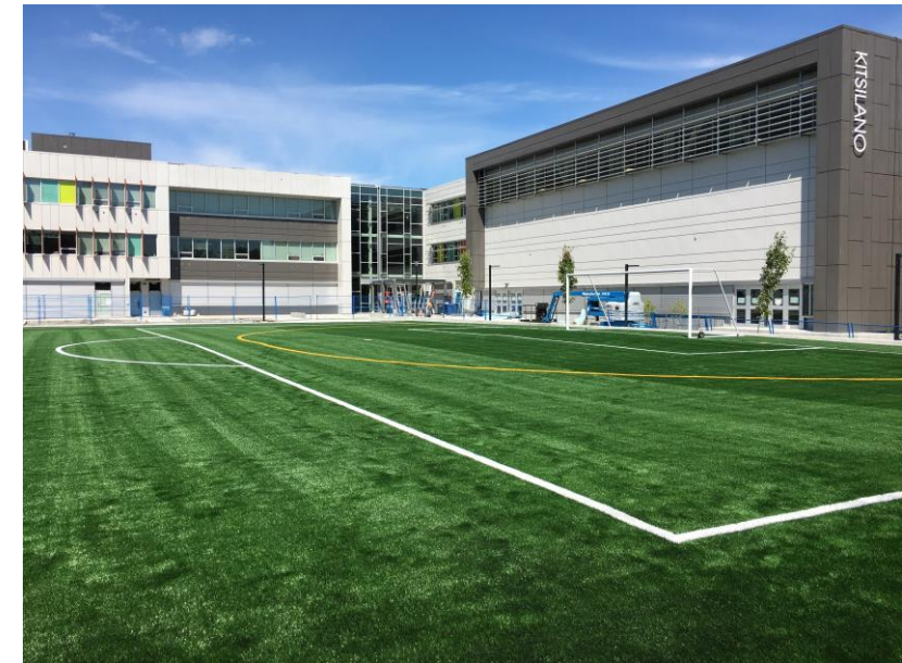
ROM – Rough order of magnitude costs based on similar projects – includes cost escalation