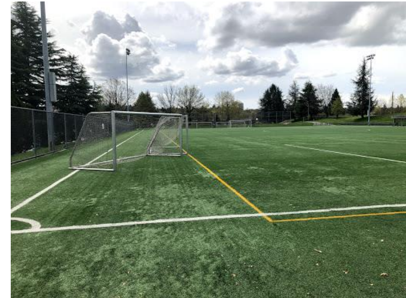
ROM – Rough order of magnitude costs based on similar projects – includes cost escalation