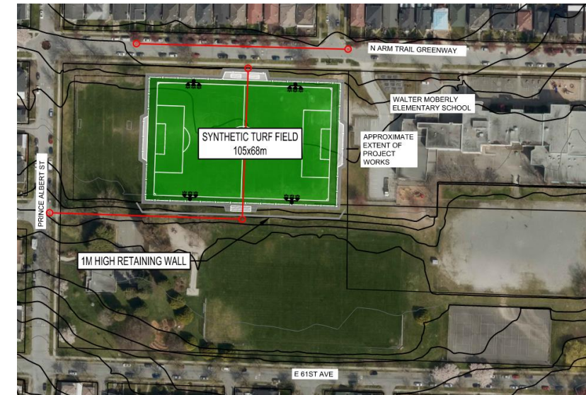
Moberly Park (north field) preliminary concept only

ROM – Rough order of magnitude costs based on similar projects – includes cost escalation