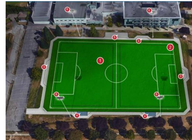
ROM – Rough order of magnitude costs based on similar projects – includes cost escalation

*project cost does not include addition of washroom/changeroom