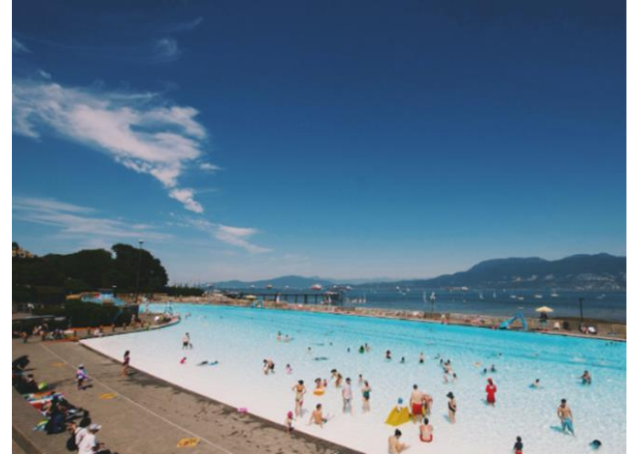
Public enjoying Kitsilano Outdoor Pool