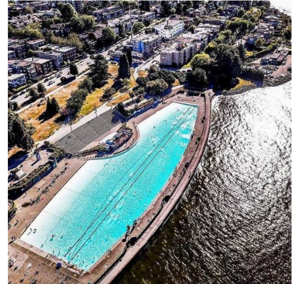
Aerial view of Kitsilano Outdoor Pool