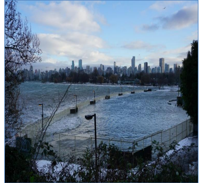
January 2022 King Tide Event