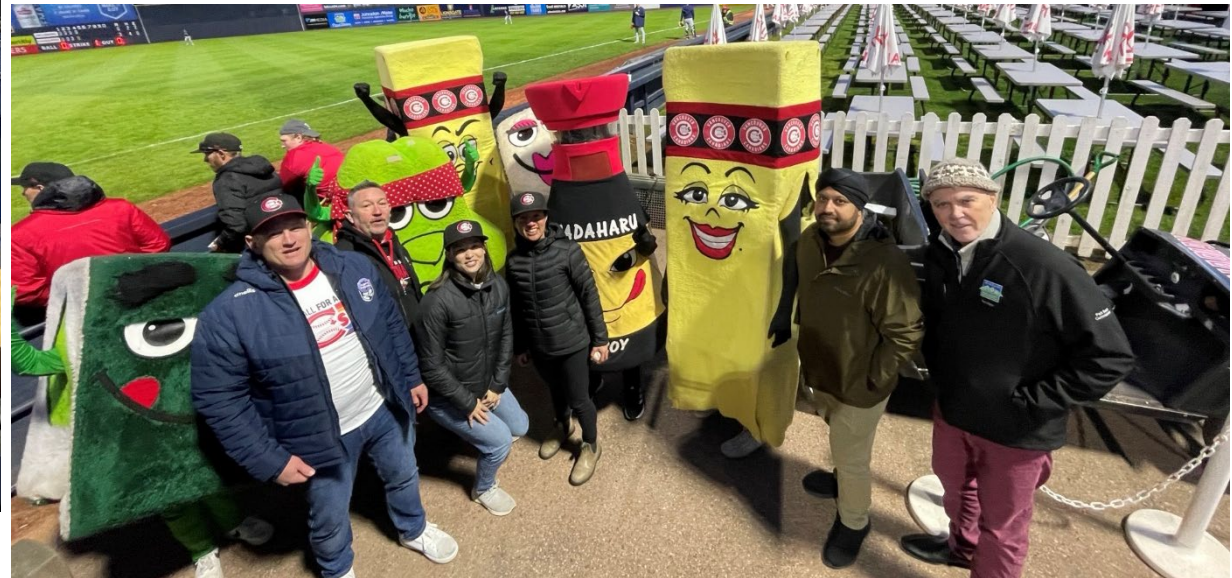
Commissioners attended the Opening Night of the Vancouver Canadians 2024 Baseball Season.