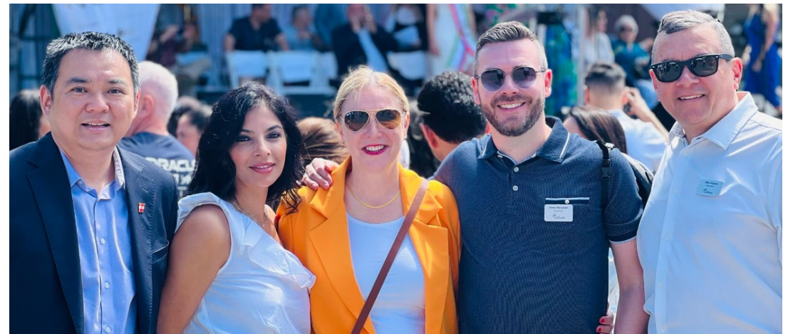
Commissioners attended Italian Day on the Drive, celebrating Italian Heritage Month alongside City Councilors and School Board Trustees.