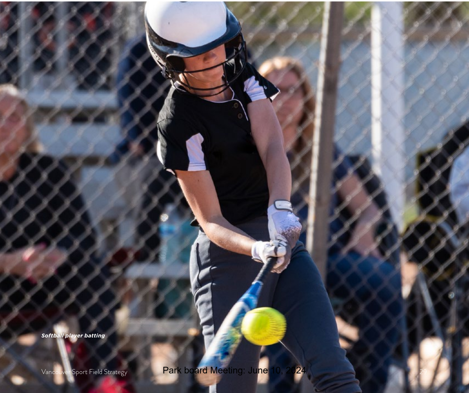
Softball player batting