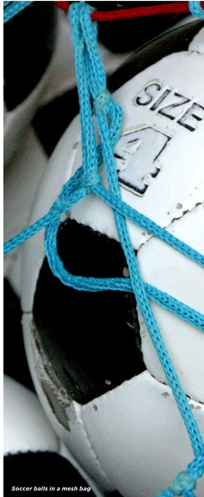
Soccer balls in a mesh bag