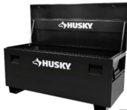
Example of box for rectangular field storage