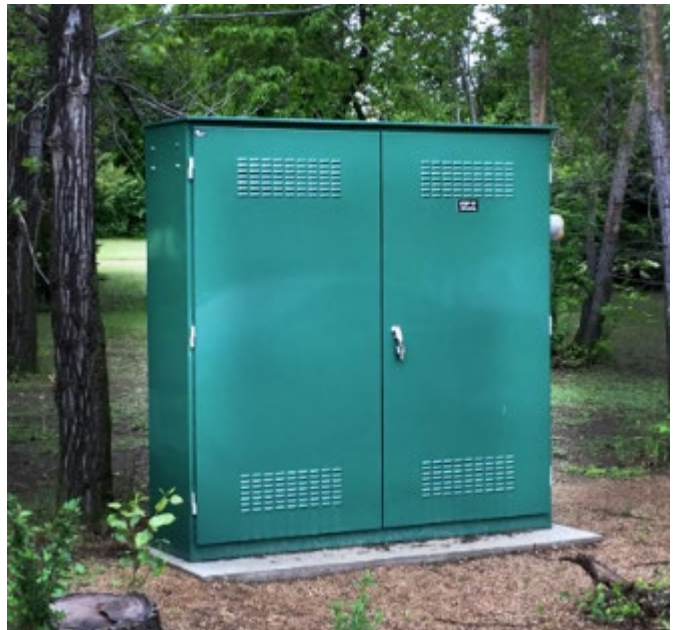
Example of small scale diamond equipment storage