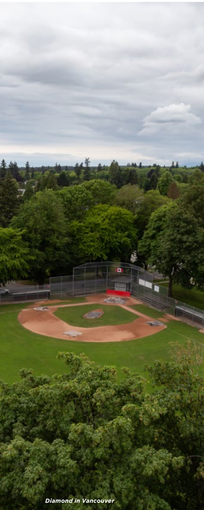
Diamond in Vancouver