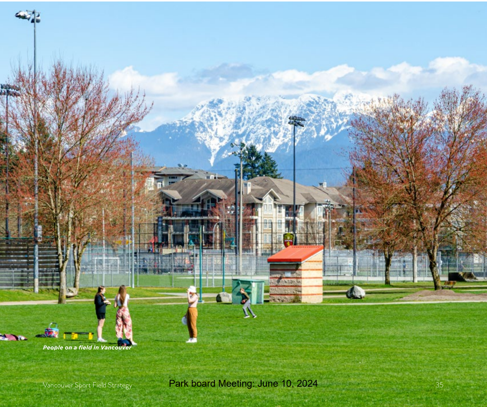
People on a field in Vancouver