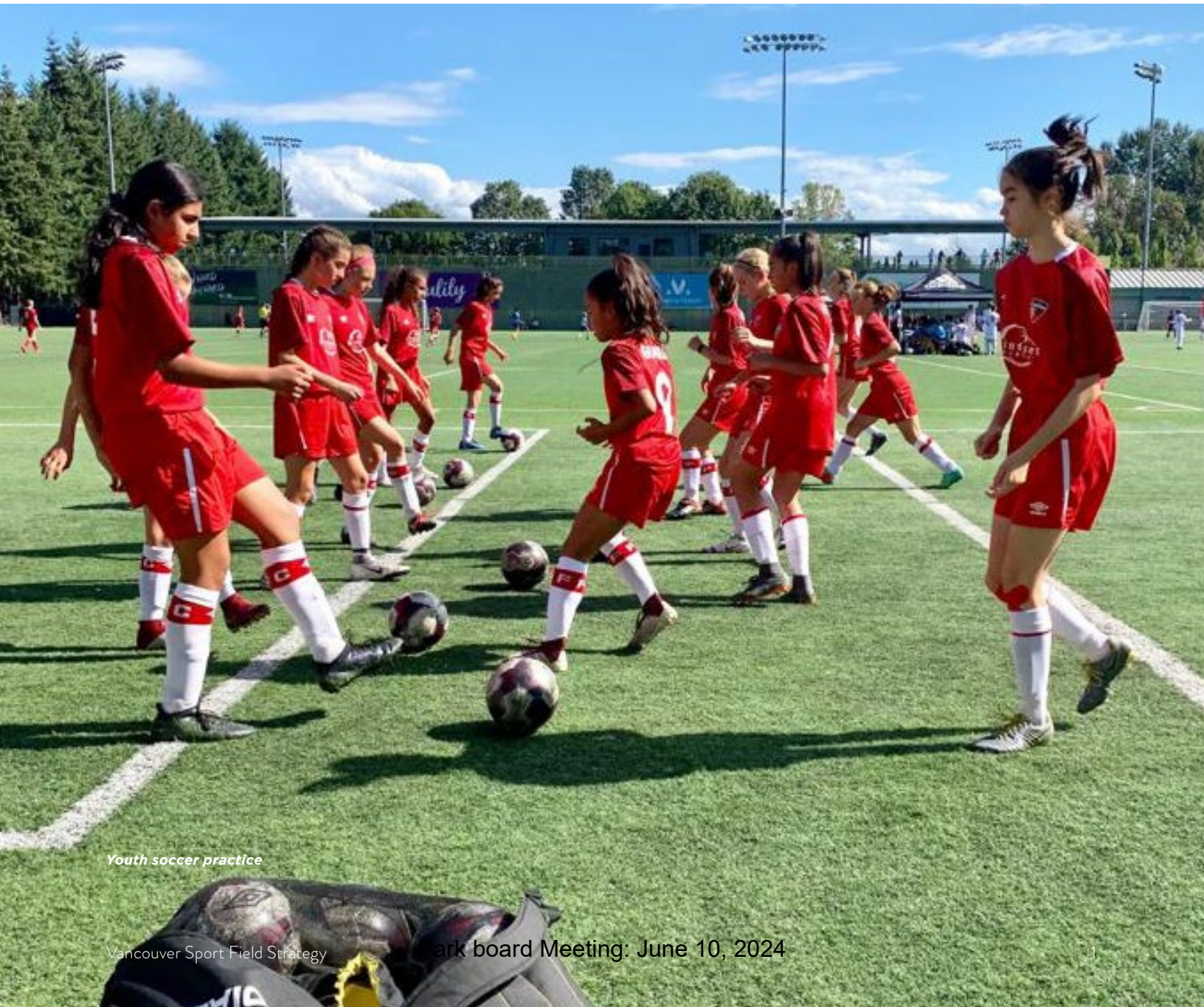
Youth soccer practice