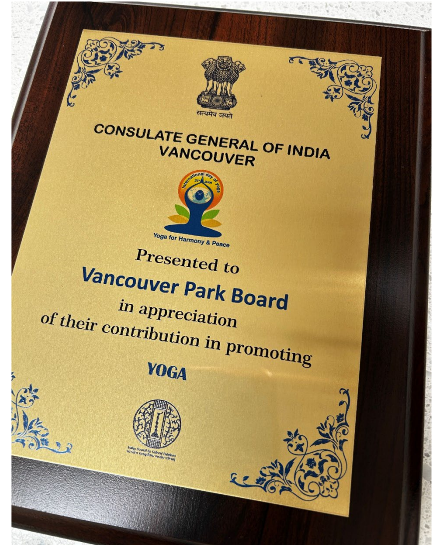
Commissioner Haer attended the International Day of Yoga hosted by the new Consul General of India, Honorable Masakui Rungsung.