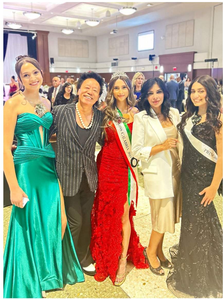
Commissioner Haer attended the 'PUGLIA Tourism and Design' event at the Italian Cultural Centre.