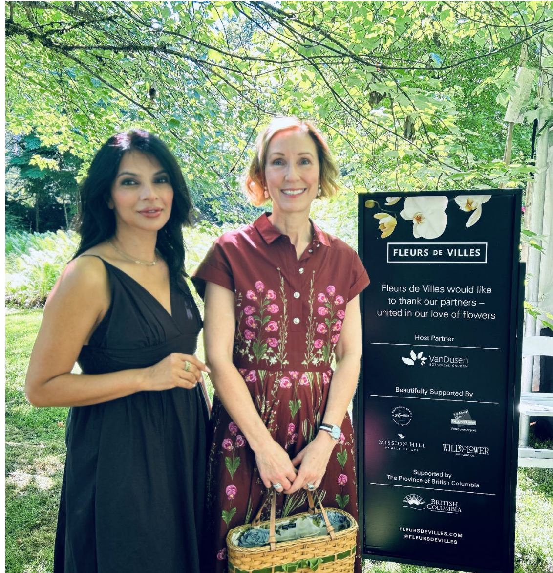
Commissioner Haer attended the opening of the Fleurs de Villes ARTISTE at VanDusen Botanical Garden.