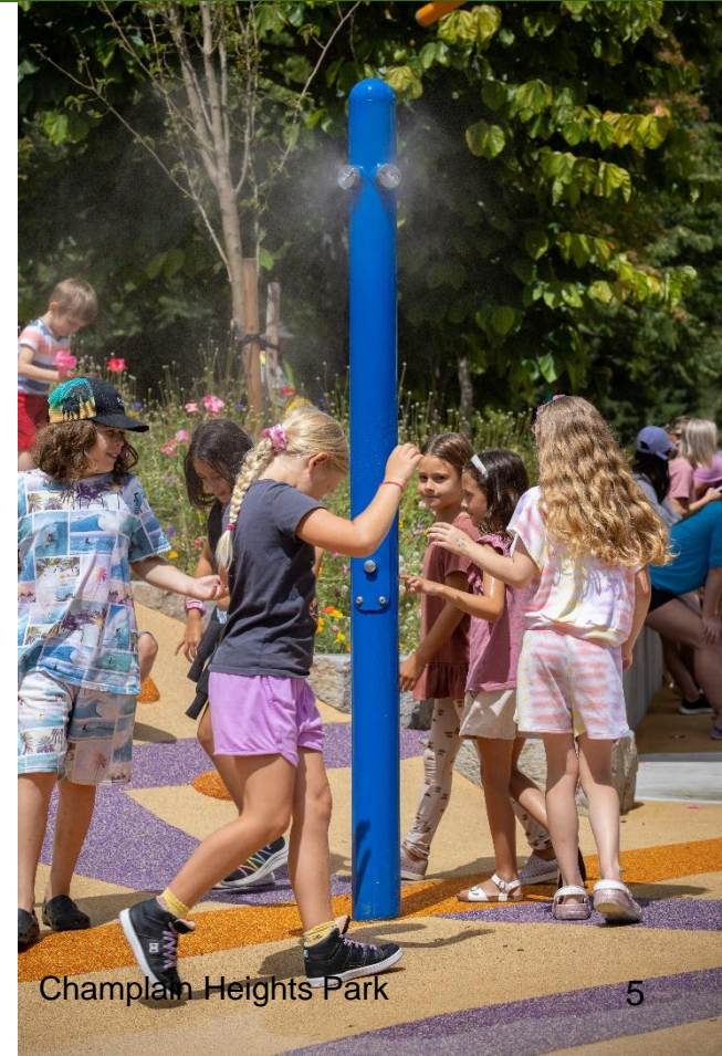
Champlain Heights Park