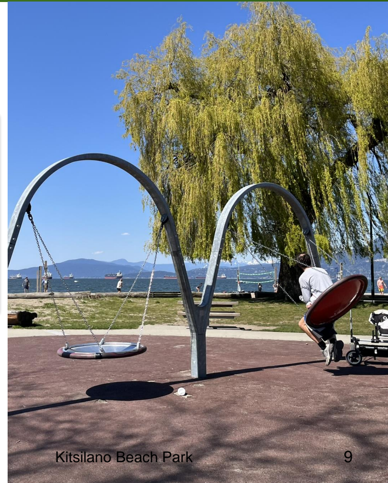
Kitsilano Beach Park