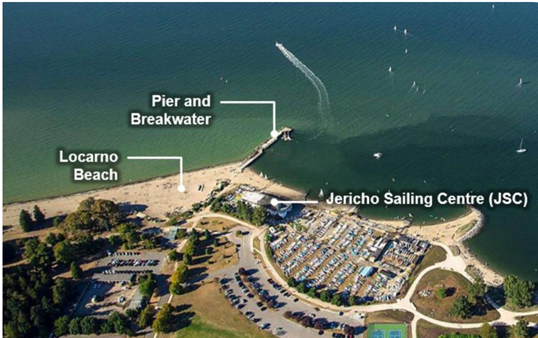
Figure 1: Aerial view showing location of Jericho Pier