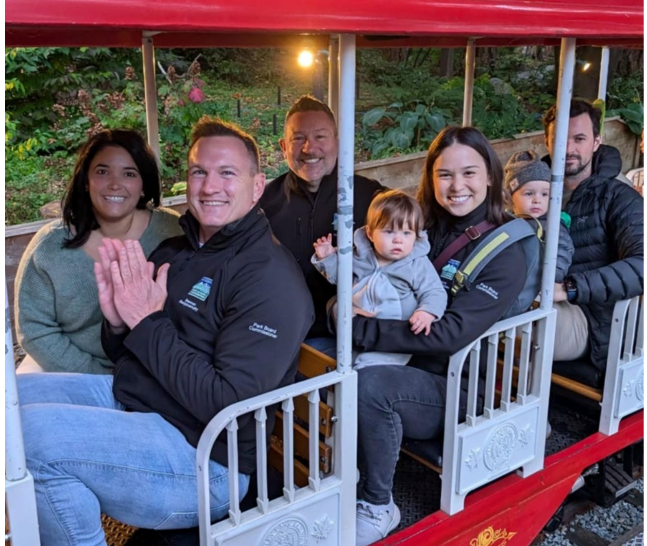
Commissioners attended the launch of the Halloween Ghost Train in Stanley Park.