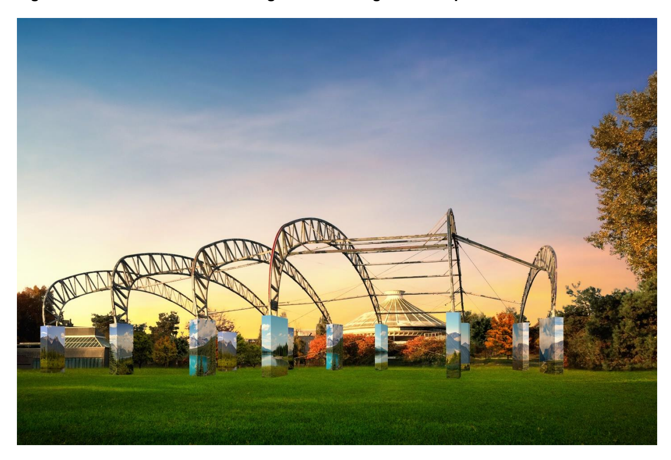
Figure 2 – Broader View of Mainstage Arch Footings with Graphics