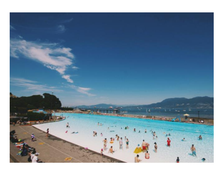
Public enjoying Kitsilano Outdoor Pool