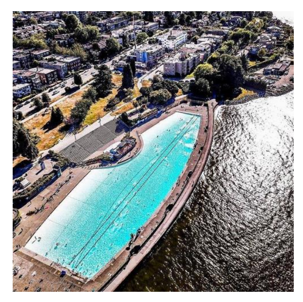
Aerial view of Kitsilano Outdoor Pool