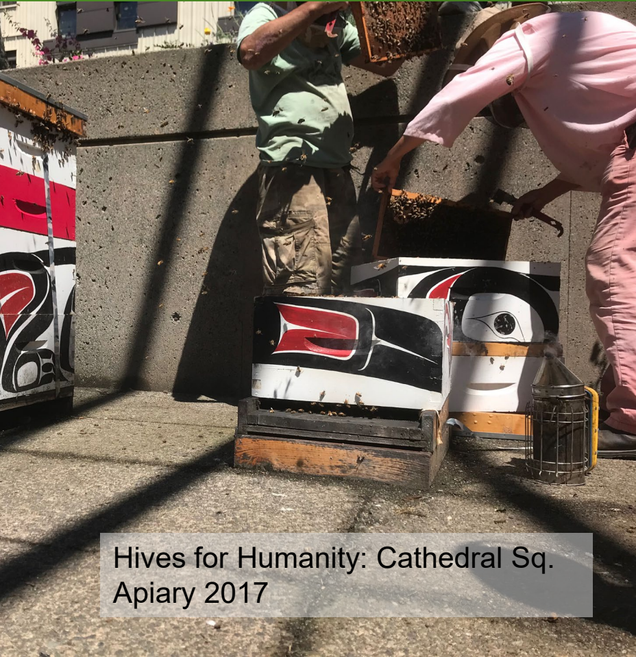
Hives for Humanity: Cathedral Sq. Apiary 2017

Established in 1993, The Neighbourhood Matching Fund (NMF) funds and supports neighbourhood - based projects that facilitate community cultural development and foster community stewardship of park land and other public spaces.