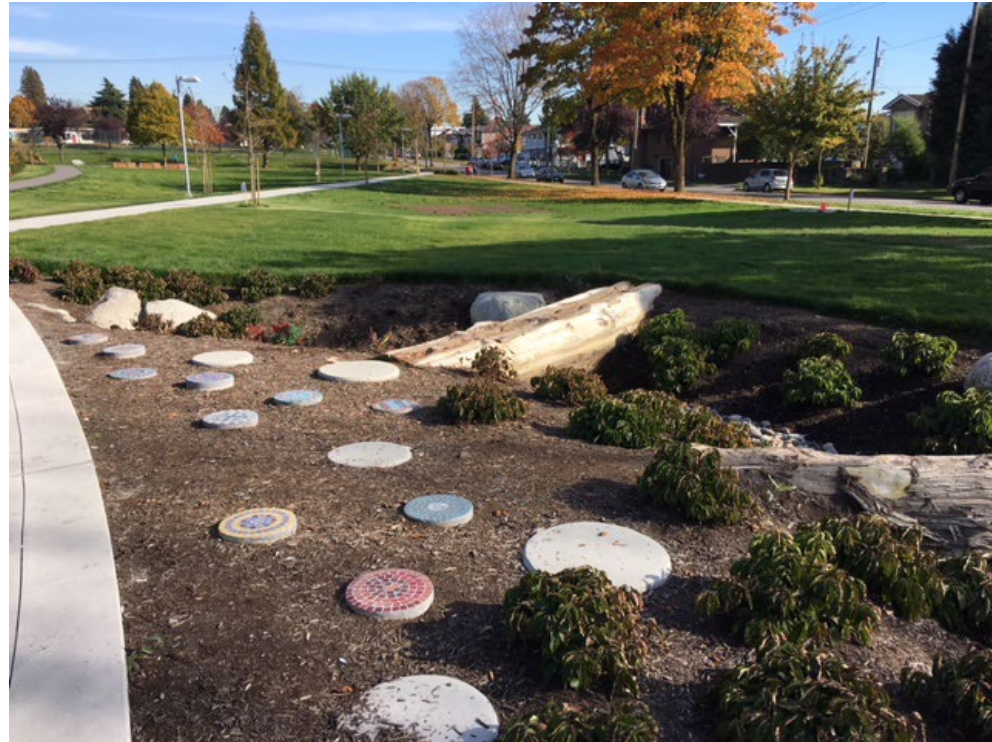
Sunset CC Mosaic Path, 2016