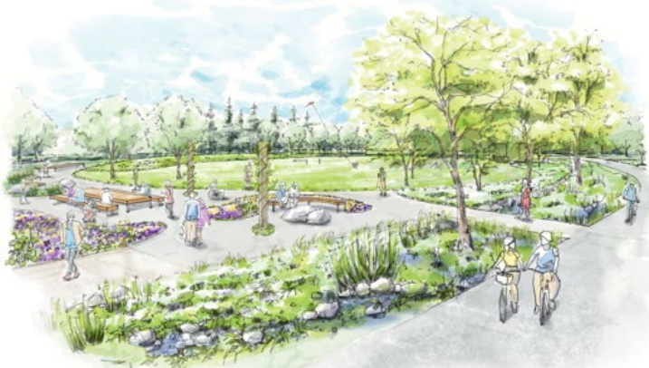
Park perspective: Arbutus Greenway looking Northeast