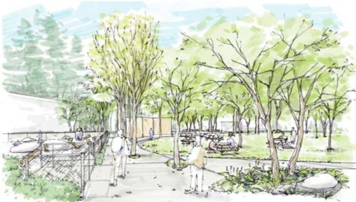
Path to new washroom with dog off-leash and picnic areas