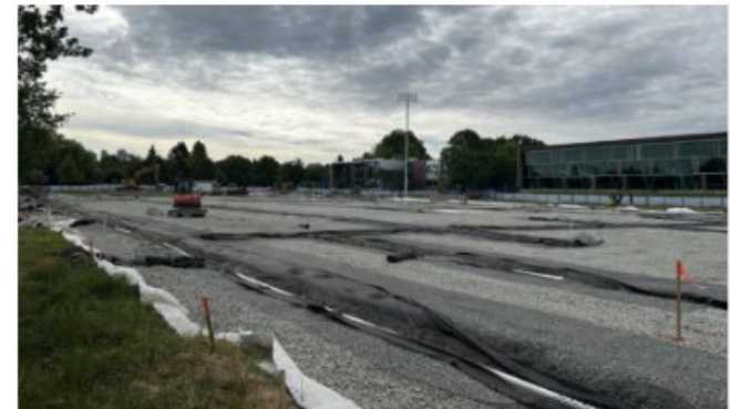
Photo of field irrigation installation