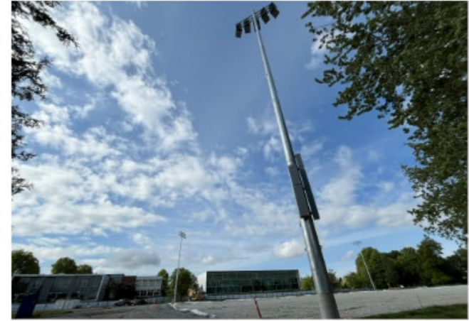
Photo of field lighting