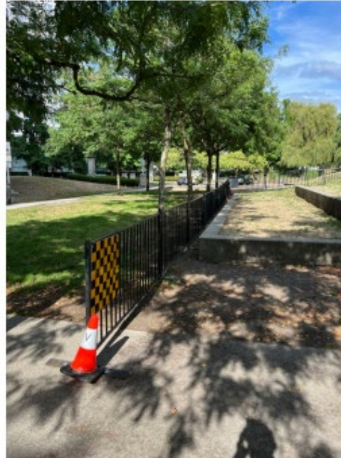
Left: Photo of west end of fence