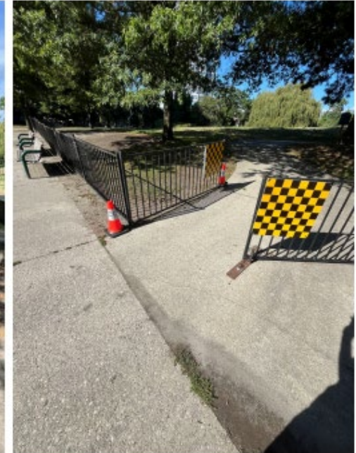
Right: Photo of entry at east end of fence