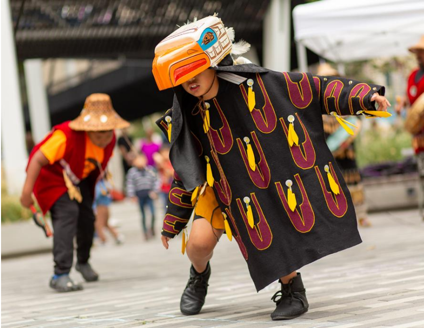
Spakwus Slolem Eagle Song Dancers, sʰəqəlxenəm ts'exwts'áxwi7 Park, 2023