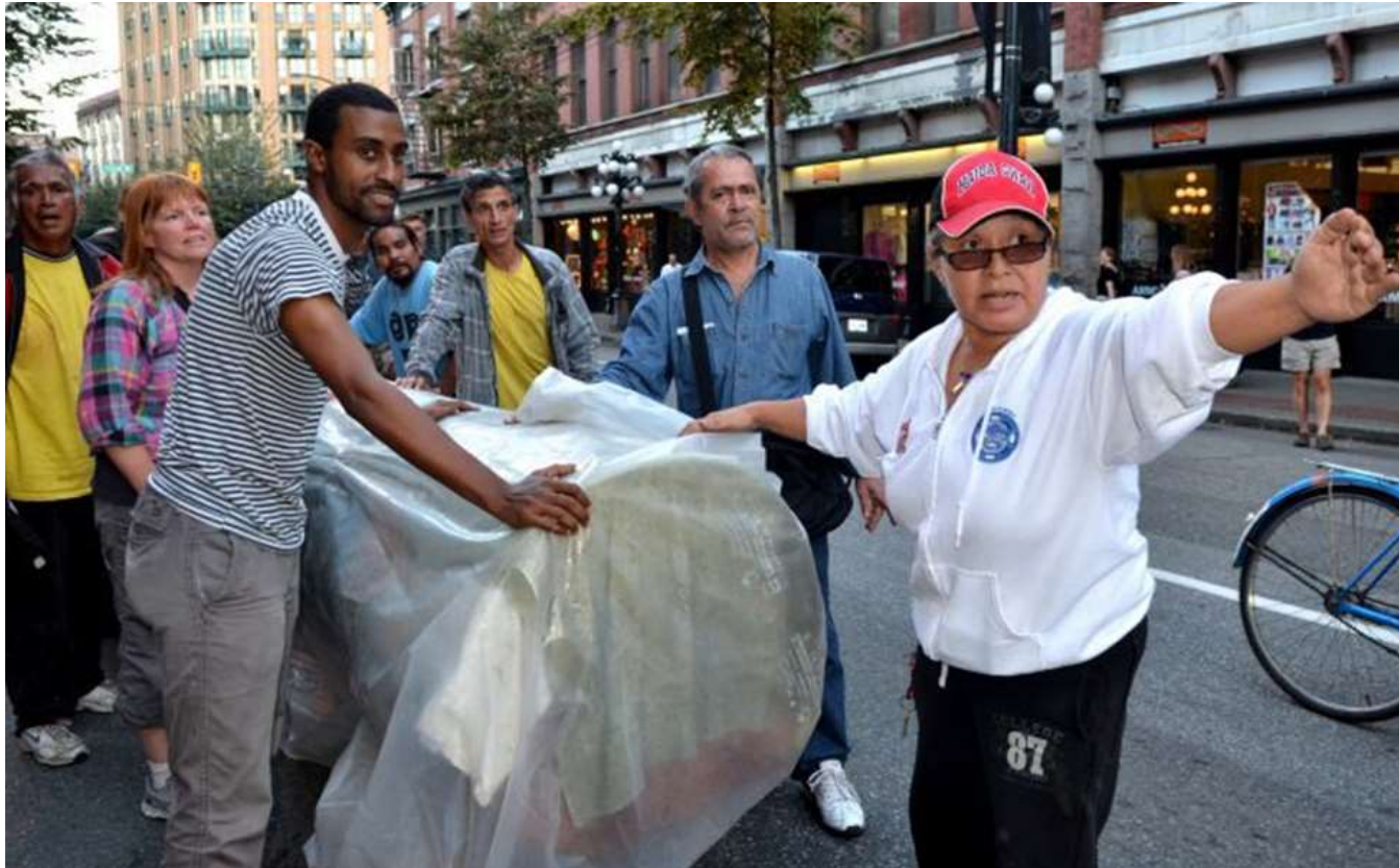
DTES Proposal to “Walk Together”