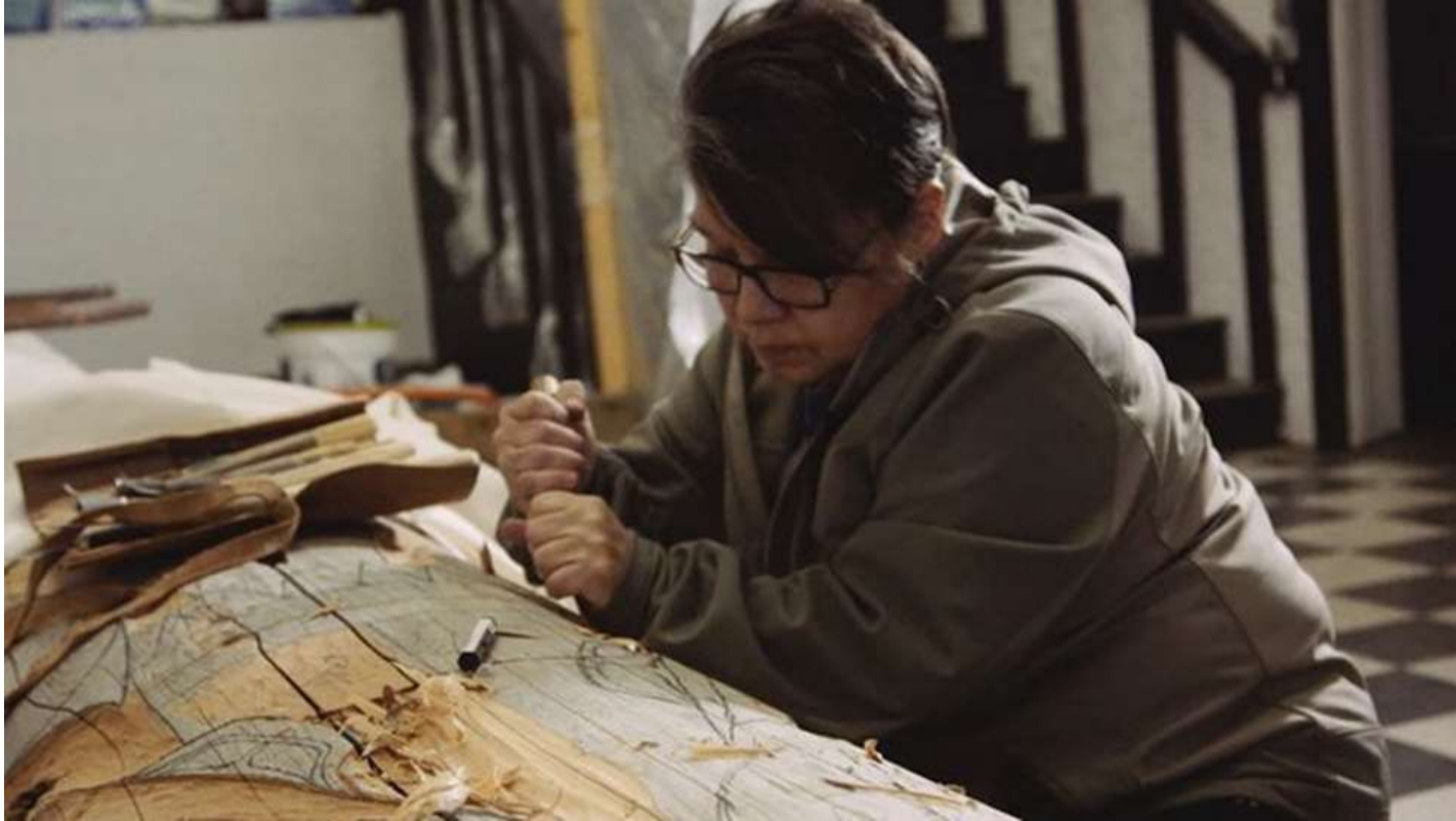
Skundaal: project artist and master carver