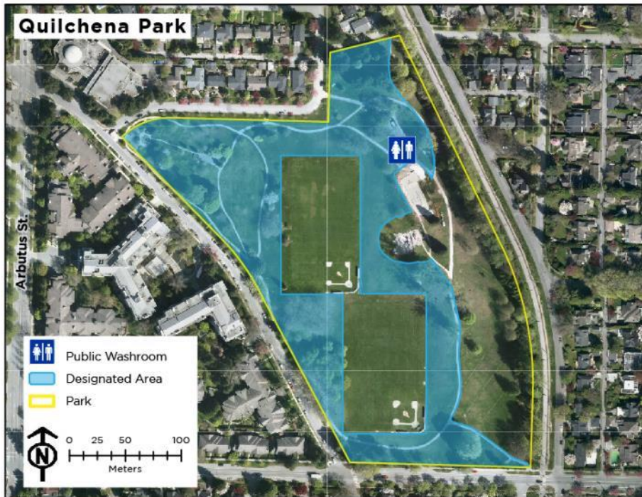
16. Quilchena Park – Designated Area