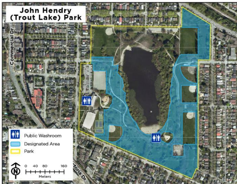
6. John Hendry (Trout Lake) Park – Designated Area