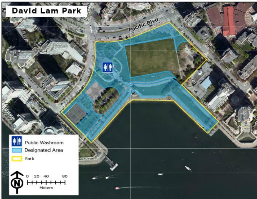
2. David Lam Park – Designated Area