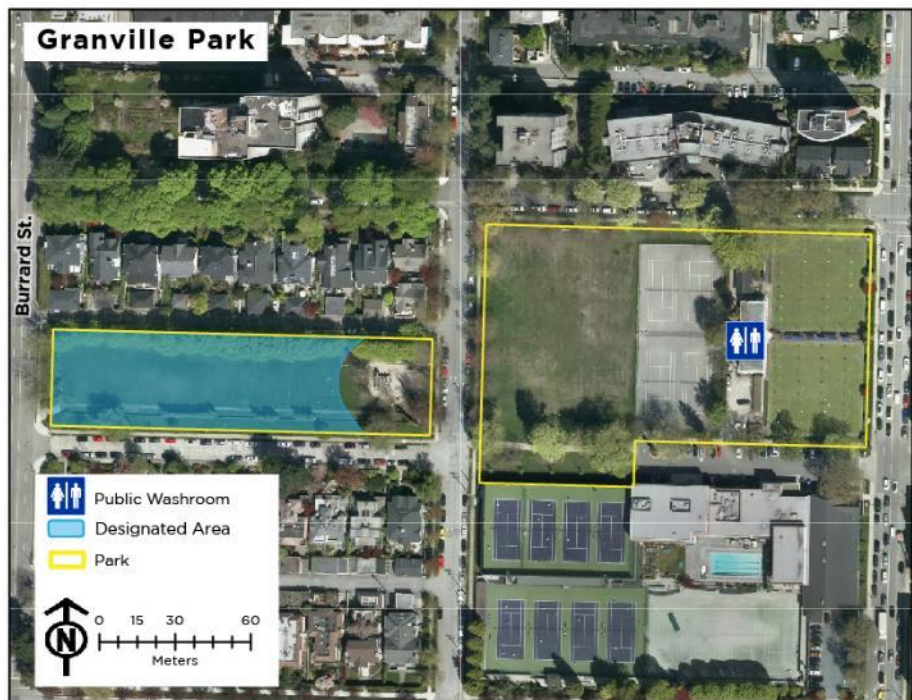
4. Granville Park – Designated Area