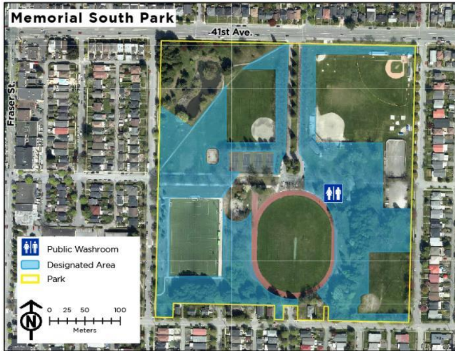
11. Memorial South Park – Designated Area