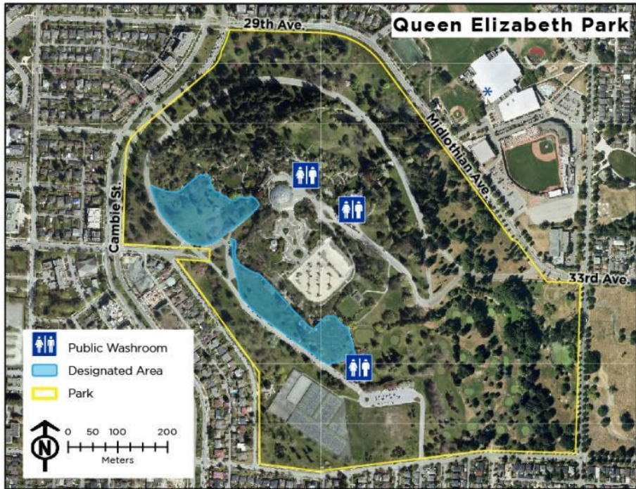
15. Queen Elizabeth Park – Designated Area