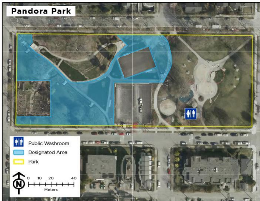
14. Pandora Park – Designated Area