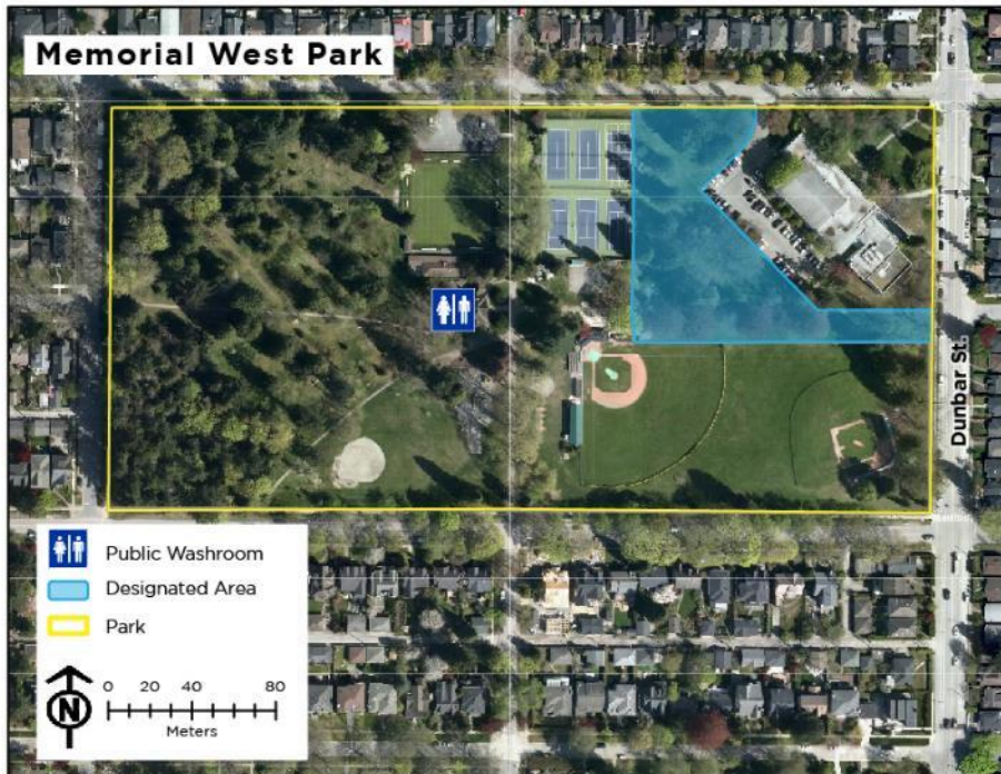
12. Memorial West Park – Designated Area