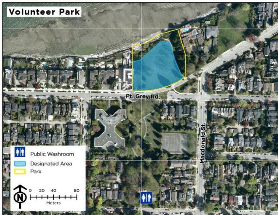
22. Volunteer Park - Designated Area