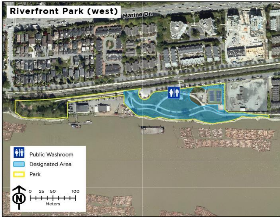
17. Riverfront Park (west) – Designated Area