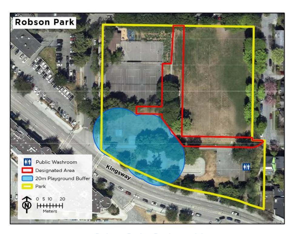
18. Robson Park - Designated Area