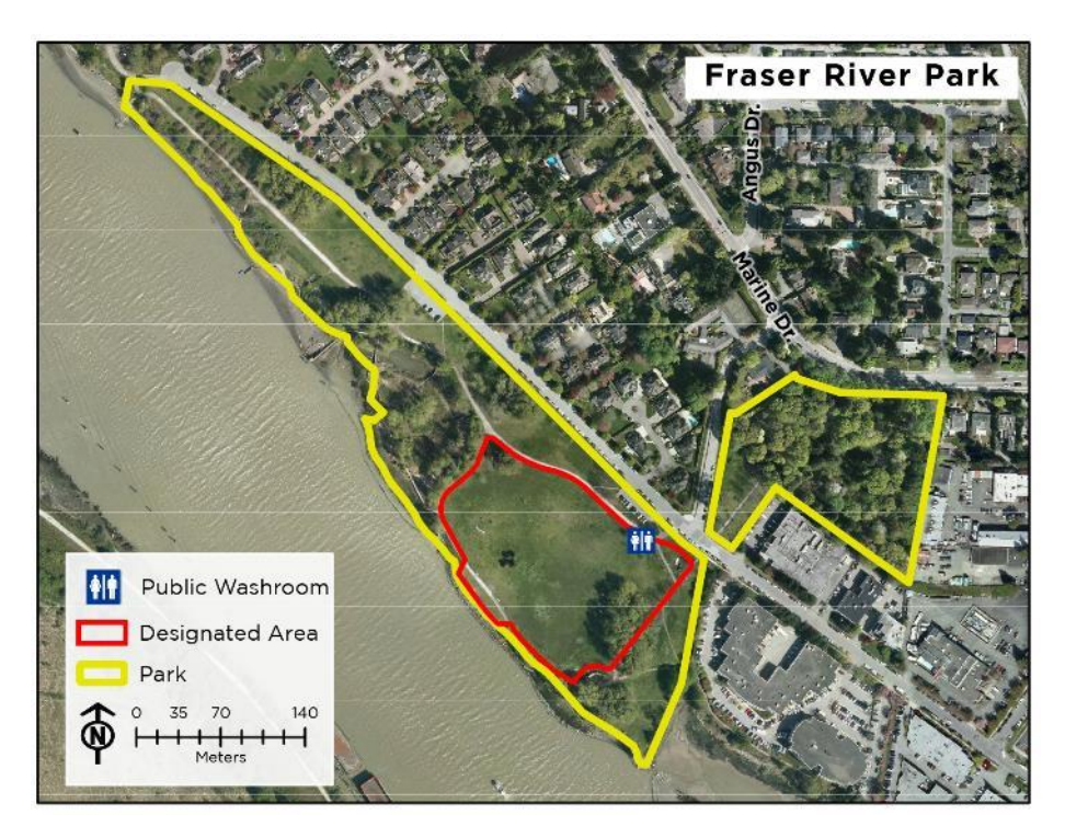
3. Fraser River Park – Designated Area