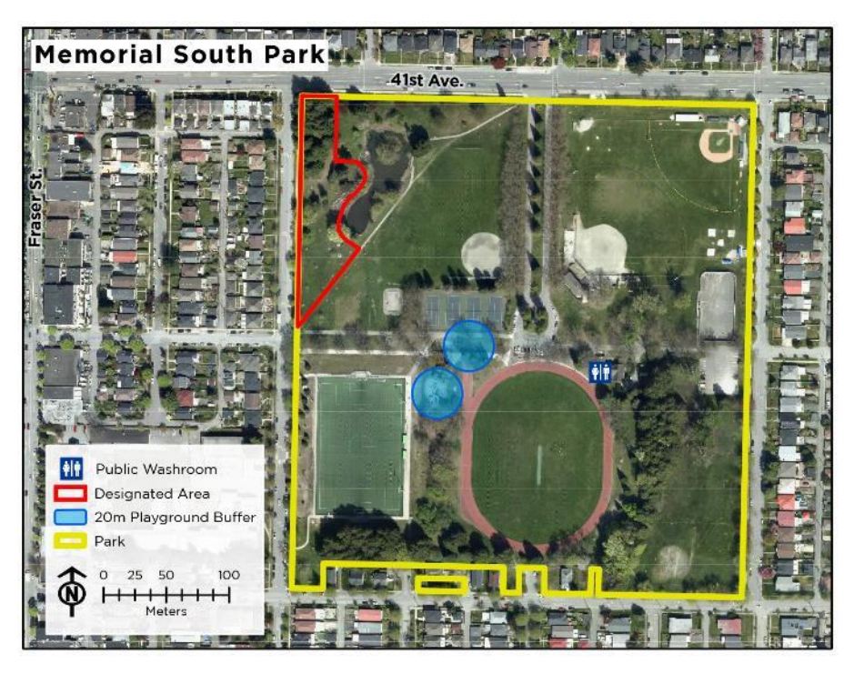
11. Memorial South Park – Designated Area