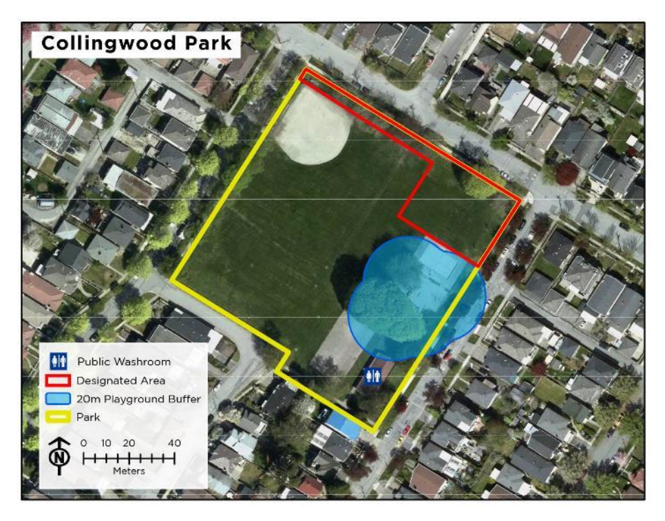
1. Collingwood Park – Designated Area