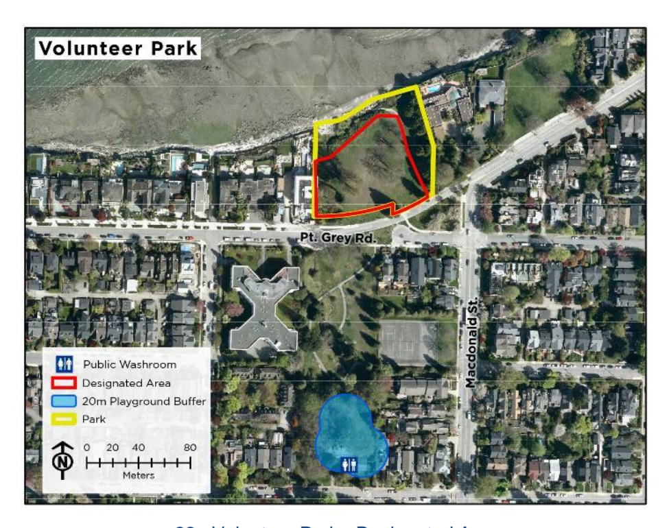
22. Volunteer Park - Designated Area