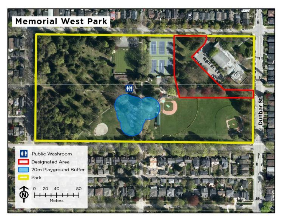
12. Memorial West Park - Designated Area