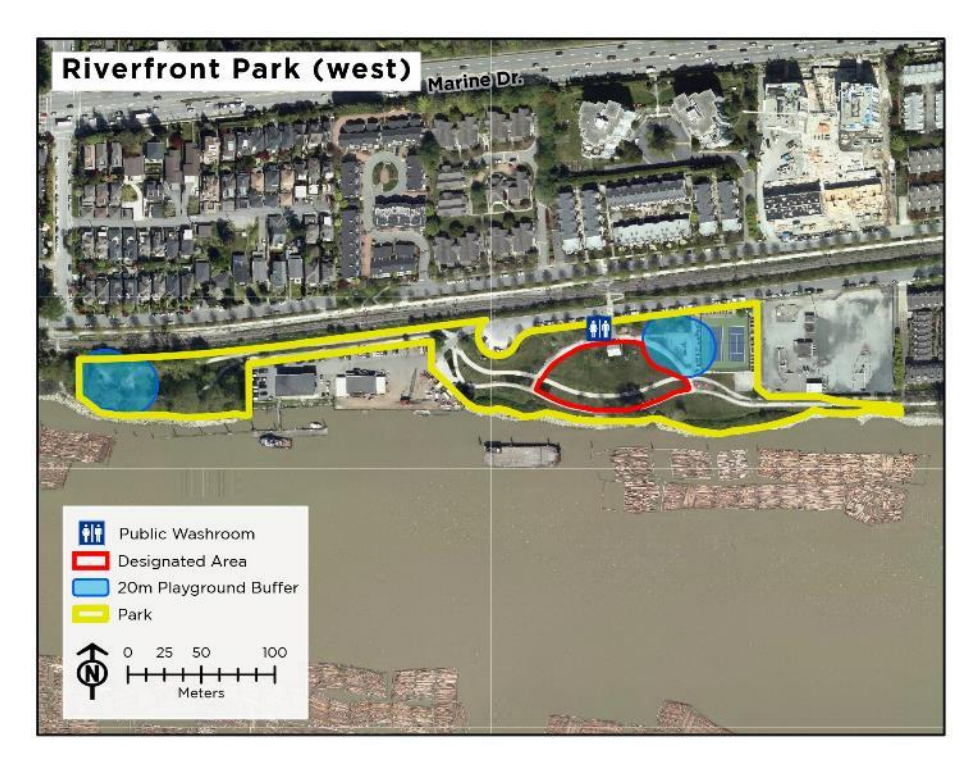
17. Riverfront Park (west) - Designated Area