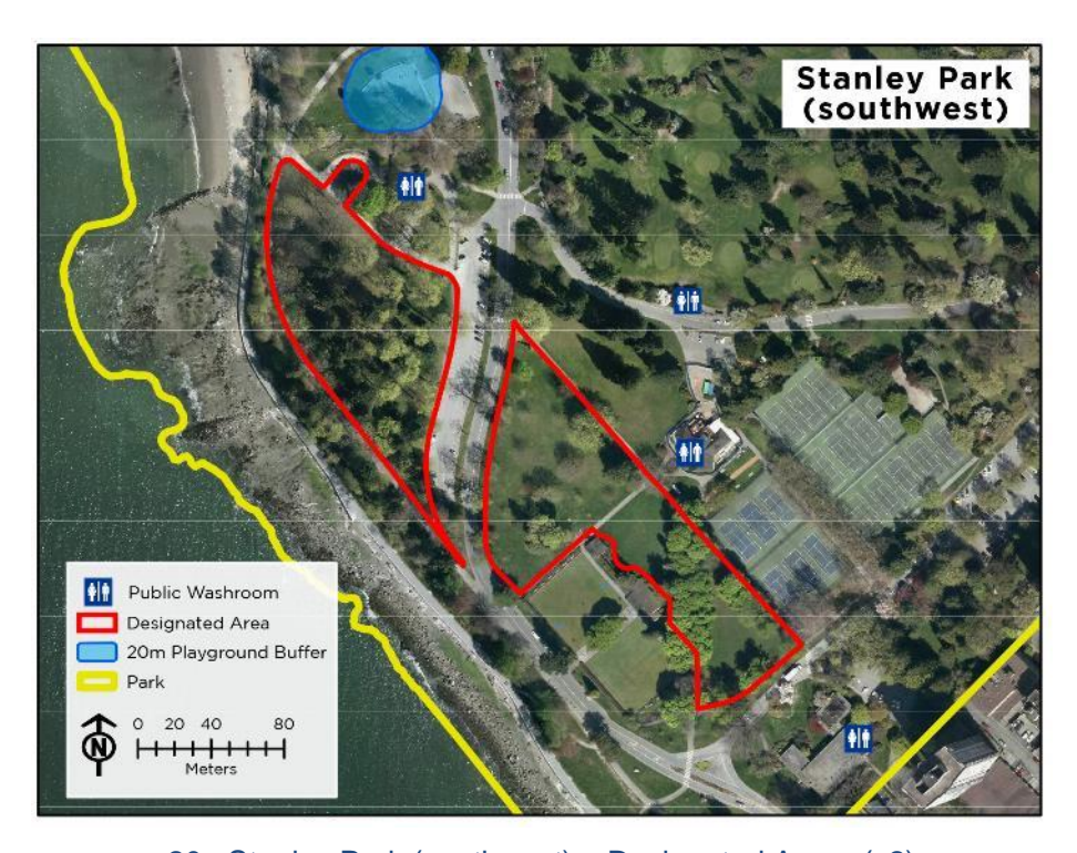
20. Stanley Park (southwest) – Designated Areas (x2)