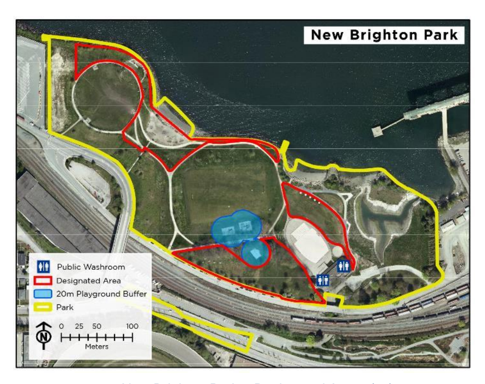
13. New Brighton Park – Designated Areas (x3)