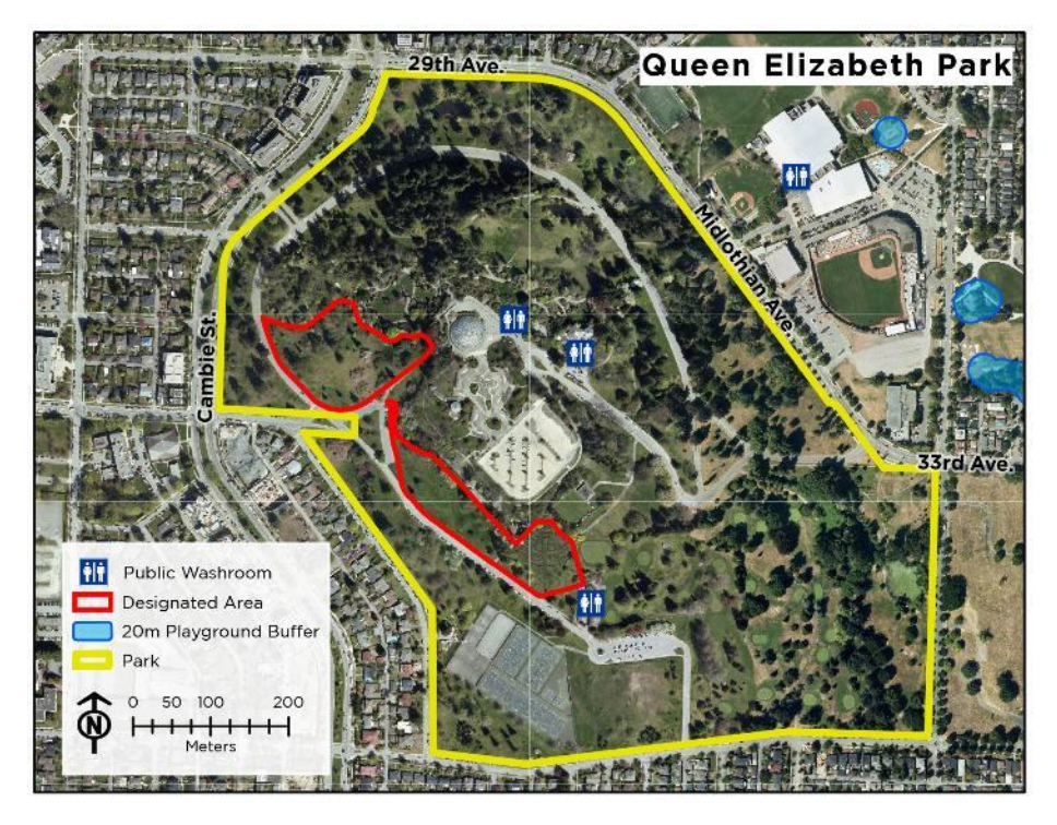
15. Queen Elizabeth Park – Designated Areas (x2)