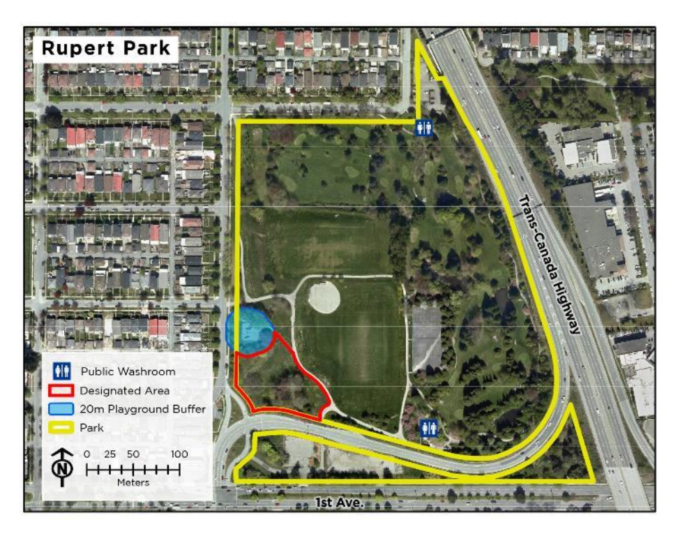
19. Rupert Park - Designated Area