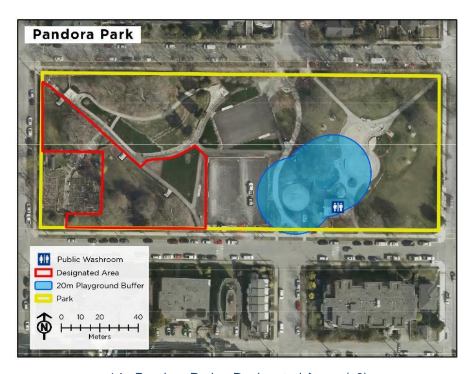
14. Pandora Park – Designated Areas (x2)