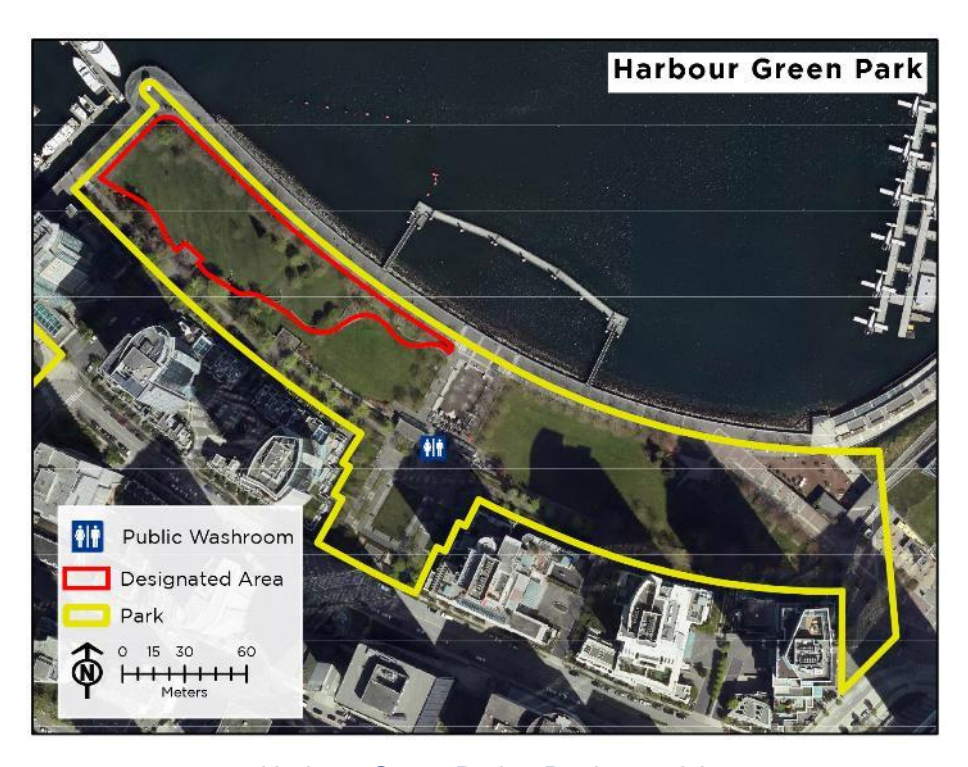
5. Harbour Green Park - Designated Area