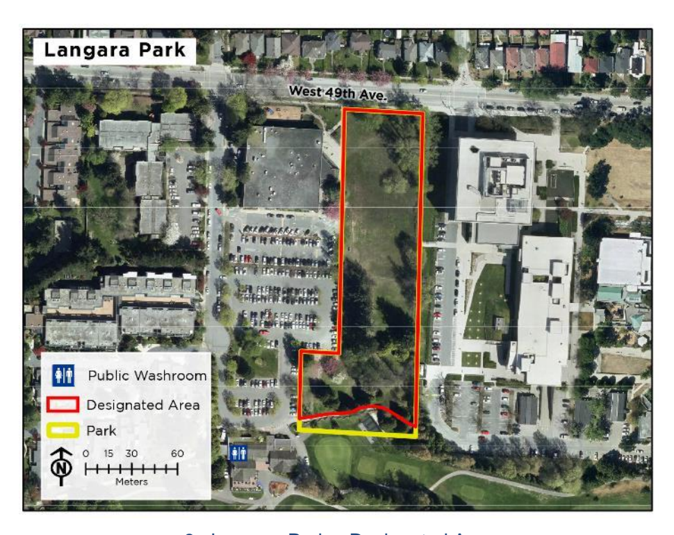
8. Langara Park - Designated Area