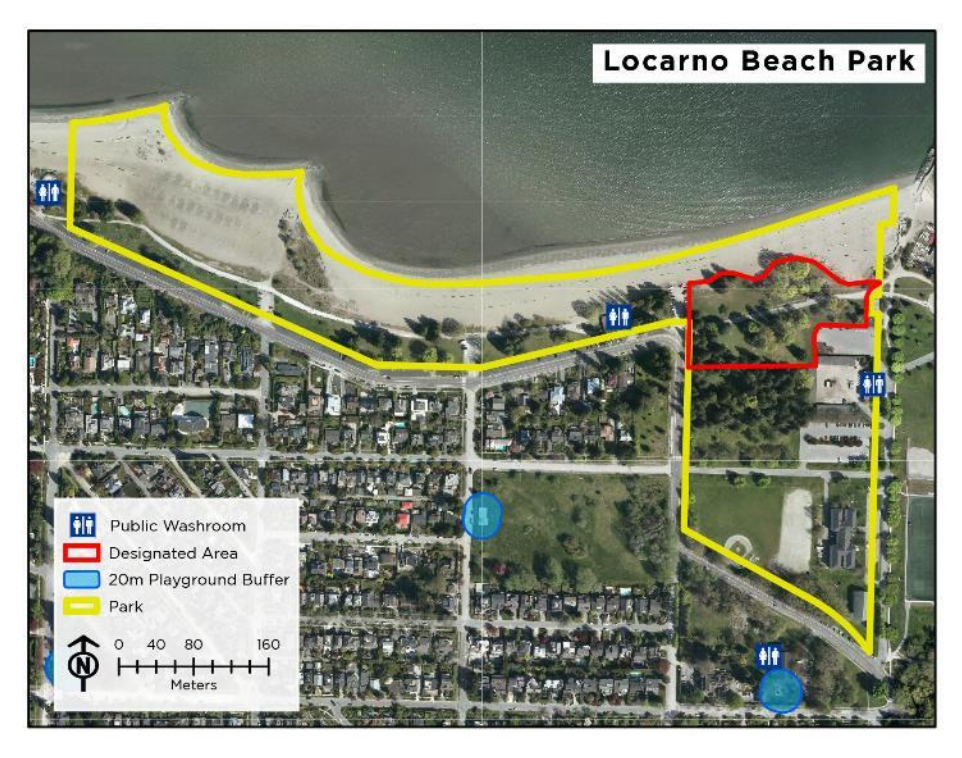
9. Locarno Beach Park - Designated Area