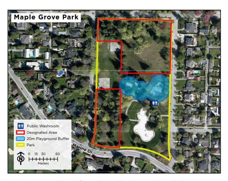
10. Maple Grove Park – Designated Areas (x2)