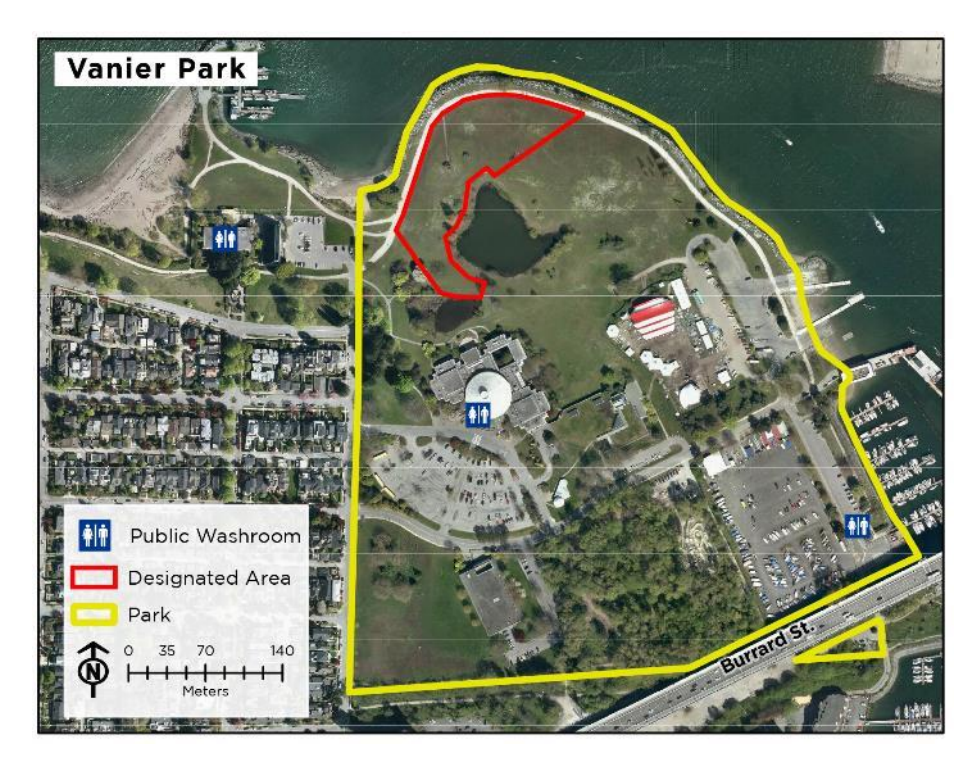
21. Vanier Park - Designated Area