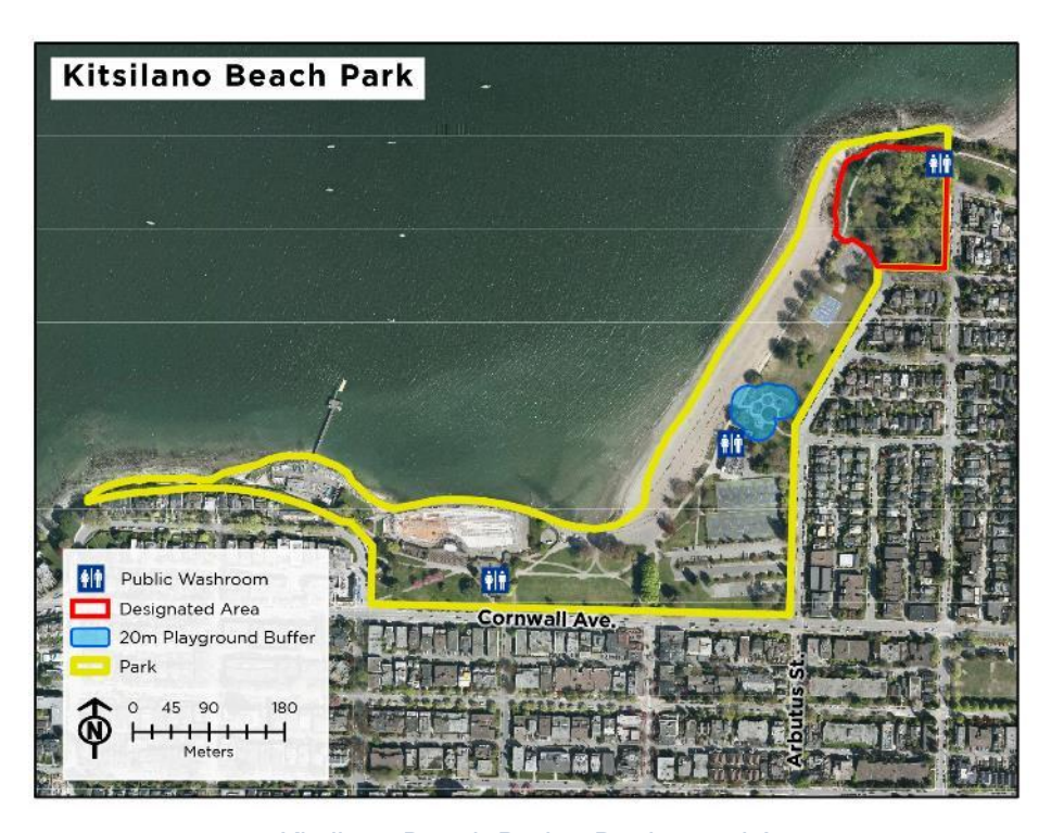
7. Kitsilano Beach Park - Designated Area