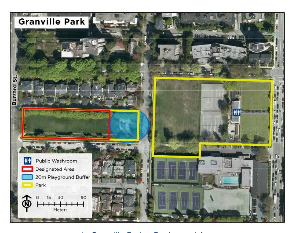
4. Granville Park – Designated Area