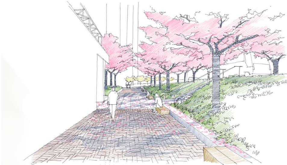
Figure 2: Art Phillips Park Redesign – Cherry tree walk extension to Burrard Street

The concept design being presented as part of the public engagement also focuses on preserving and extending the popular row of cherry trees through the park to Burrard Street (see Figure 2), making improvements to site accessibility, adding seating to support park and transit users, and creating open space to support site programming.