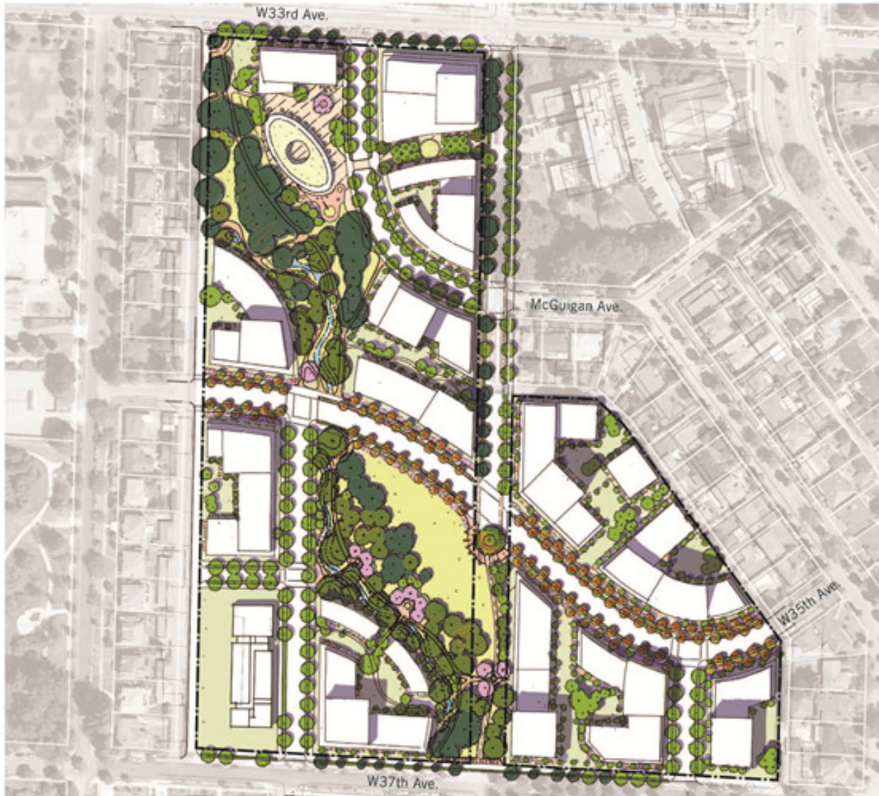
Figure 1: Policy Statement illustrative concept