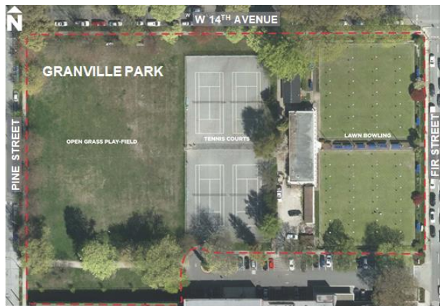
Figure 2: Granville Park (Kitsilano)

An analysis of parks in the Kitsilano and Fairview neighborhoods revealed that Granville Park (see Figure 2) and Heather Park (see Figure 3) have favorable existing conditions to potentially support new dog off-leash facilities. These new sites would help to address the off-leash needs identified in these communities. The purpose of the RFP is to seek responses from qualified consultant teams to assist with engagement and to lead the design of both off-leash areas.