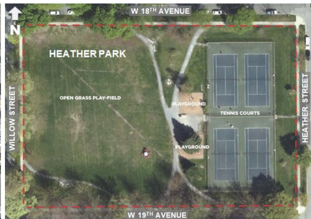
Figure 3: Heather Park (Fairview)