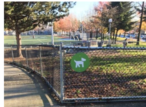
Figure 3: Andy Livingstone off-leash sign