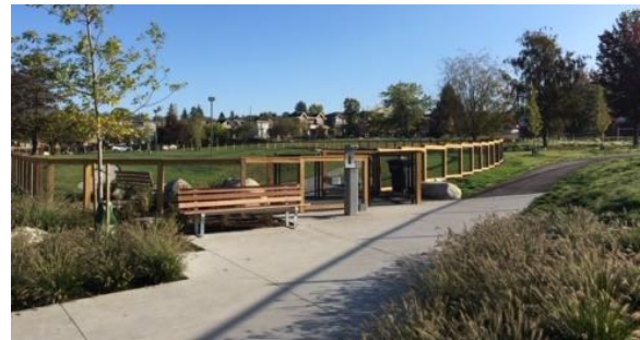
Figure 1: Upgraded Sunset Park off-leash area.

Sunset Park Dog Off-Leash Area Renewal (completed 2018) – first project to incorporate the strategy's design guidelines; includes various surface materials, looping path, formal & informal seating, shade, and drinking water for people & dogs (see Figure 1).