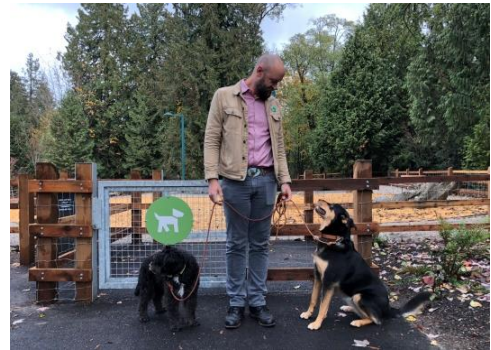
Figure 2: Renfrew Park dog off-leash area

Renfrew Park New Dog Off-Leash Area (completed October 2018) – created a new fully enclosed 0.14 hectare off-leash area in a portion of an underused parking lot; includes two double gates and various amenities, including a walking path, benches, picnic tables, dog play features; and various surface materials (see Figure 2).