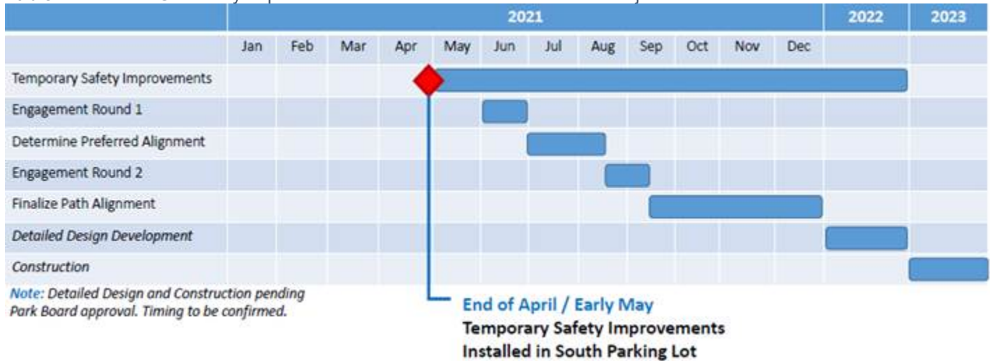
Table 1: Seaside Greenway Improvement Kits Beach Park – Estimated Project Timeline

Further to the briefing memo sent to you regarding the Seaside Greenway in Kitsilano Beach Park (included below), in response to Commissioner enquiries I am writing to let you know that staff are aiming to have the interim cycle path safety improvements in the south parking lot in place in April 2021. Following is an updated project timeline for your reference.